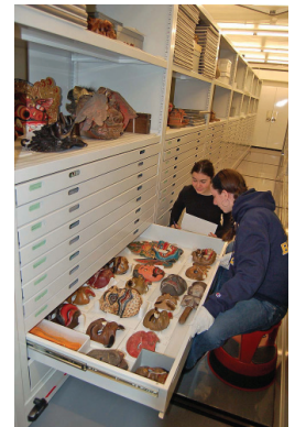
Logan Museum of Anthropology Storage, Before (left) and After (right) 2002 CAP Assessment