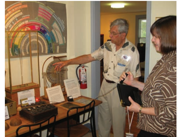
Radio & Television Museum Bowie, Maryland

To learn more about eligibility, visit www.heritagepreservation.org/CAP , e-mail CAP at cap@heritagepreservation.org , or call 202-233-0800.