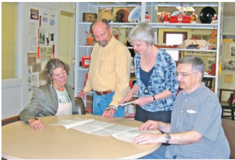
Macedonian Museum Fort Wayne, Indiana

“CAP was immensely helpful for planning the care and growth of our museum. We couldn’t have asked for better assessors!”