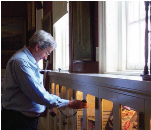
Historical Society of Berks County Museum and Library Reading, Pennsylvania

CAP supports assessor professional fees, travel costs, and on-site expenses. If the assessment costs exceed the CAP allocation amount, the museum is responsible for the difference.