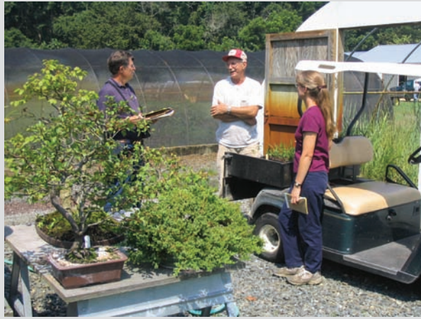
Adkins Arboretum, Ridgley, Maryland